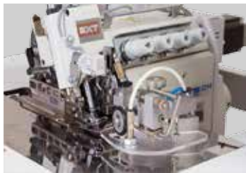
FX 6300 - IX