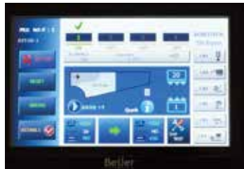
FX 6300 - IX