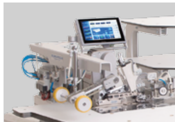
FX 6300 - IX

Max. Sewing Speeds : 6.000 r.p.m Max. Stitch Length : 1 or 3,8 mm